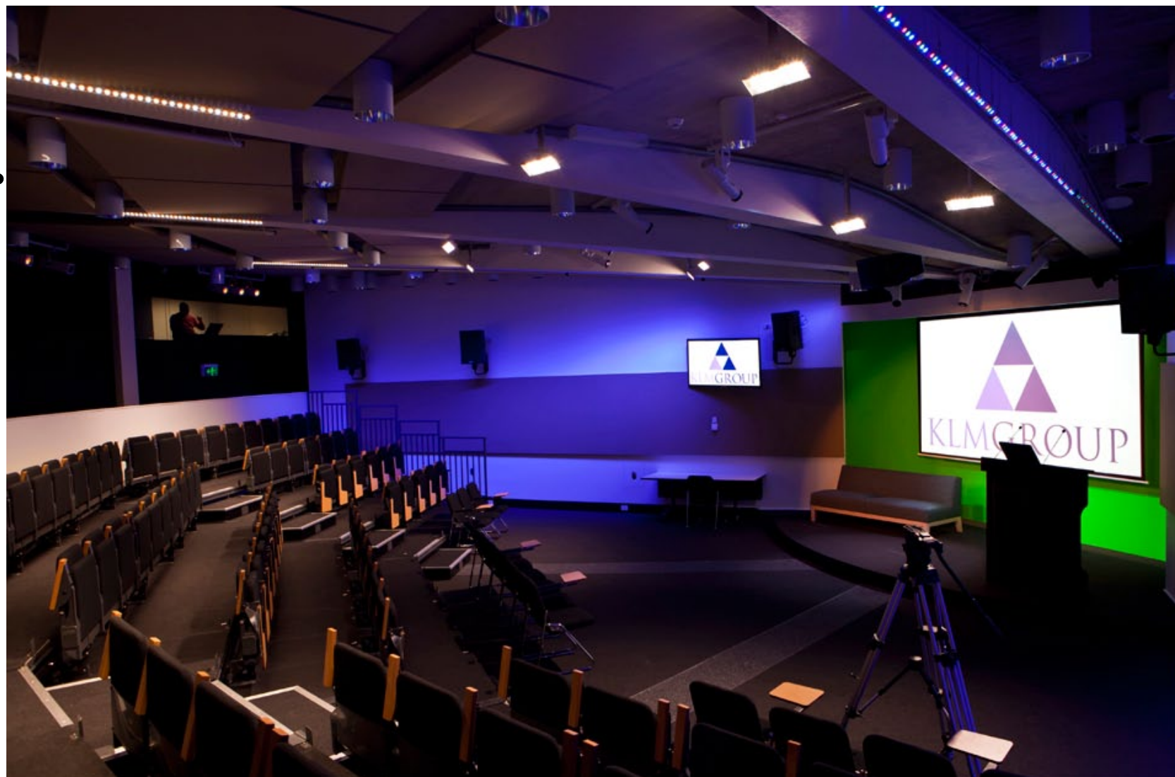
Above: The media theatre in presentation mode with seating rolled out and lectern ready for a media conference. Top right: Crestron control screen for sound zone control in the AOCC. Centre right: Crestron control screen for video source selection to desks and videowalls in the AOCC. Bottom right: Crestron control screen for video source selection in the ICC. The deliberate misspellings in the screens may be a means of confusing our enemies by obfuscating the true purpose of these operations centres.

There is really only one room in the entire Edmund Barton complex that actually welcomes visitors (sometimes), the Media Theatre. With facilities jointly designed by KLM and Videocraft, the theatre is intended for media briefings, press presentations, interviews and video production. The sound in this facility encompasses acoustic treatment, sound reinforcement and audio signal splits for broadcast media and in-house video production. The use of retractable seating allows the space to be used either for presentations and media conferences or as a flat floor production studio. A green screen wall and accompanying LED lighting facilities allow the three-camera production and recording system substantial flexibility as a media briefing venue or as a source of live or recorded material. Crestron digital media is used for both signal switching and routing and for integration into the automated control booth. The two edit suites round out a small, flexible production facility that would seem far more than adequate for the needs of any police force. 🐣